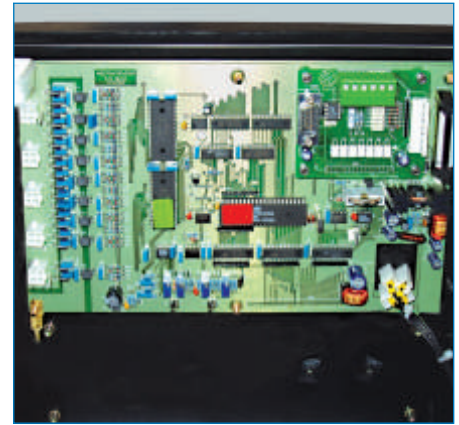
Optional RS485 connection with modbus protocol