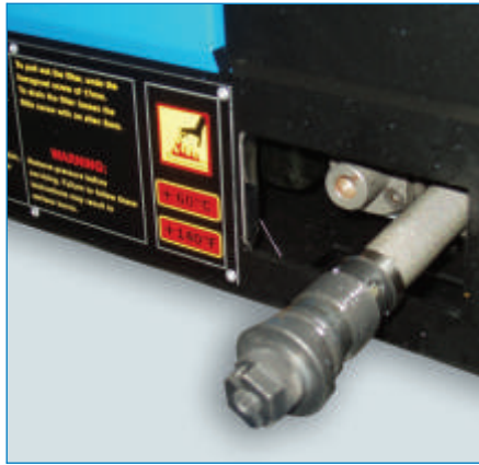
Filter with pressure discharger