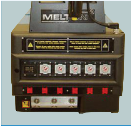
Up to six compatible channels for hose-gun connection