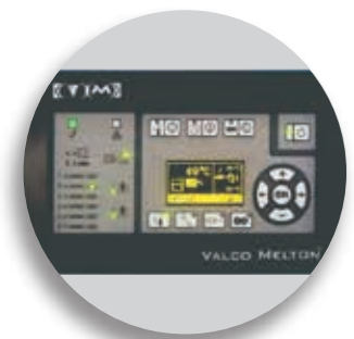
Integrated grammage control, accessible through a MFC controller, simplifies the operator's programming tasks to eliminate product loss and downtime associated with incorrect coat weight adjustments.