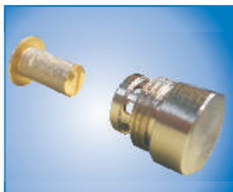
Internal filter provides continuous adhesive filtration