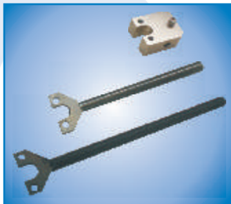
Total adaptability to various existing brackets in the market