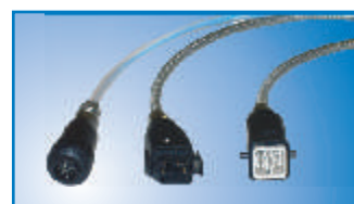
100% compatible connectors