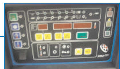
Easy-to-use control panel.