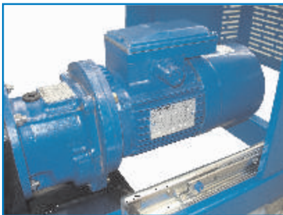
AC motor with vectorial frequency variator.