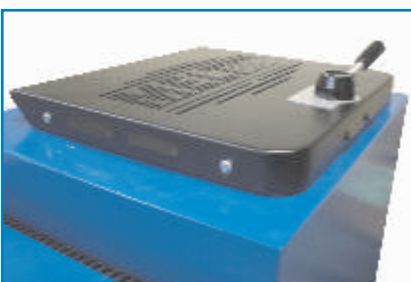
Air-tight tank open system ensures correct processing of PUR adhesives.