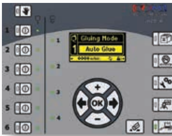
Auto Glue Mode