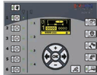
Pattern | Display